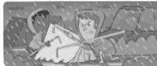
Mum and Dad got VERY wet!

This has been the best day ever! We are camping in a real tent, right by the seaside!